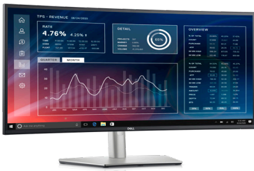
UltraSharp 34 Curved Monitor USB-C Hub - U3423WE

Large Single Display with USB Hub for increased productivity and reduce home office clutter.